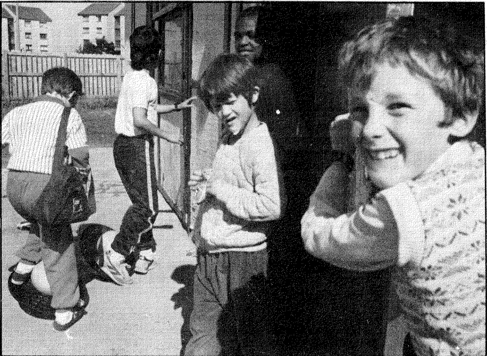
The youngsters from Clovenstone certainly seem happy with their playhut!

Eight members of the girls club recently spent some time in a log cabin in Dunsyre and they all thoroughly enjoyed themselves.