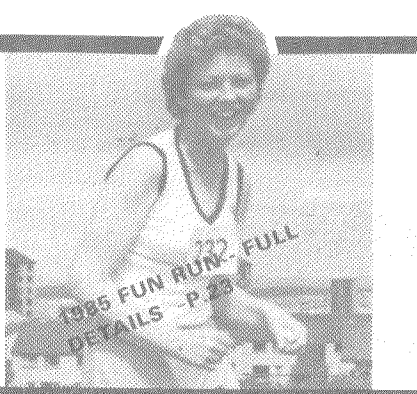
1985 FUN RUN - FULL DETAILS P.23