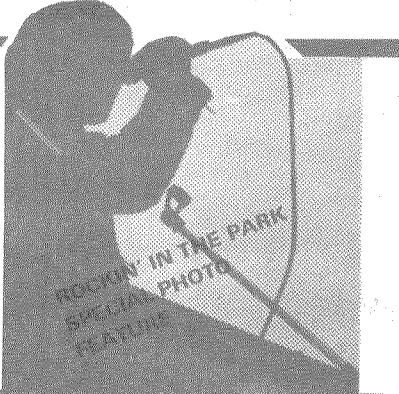
ROCKIN' IN THE PARK SPECIAL PHOTO P.25