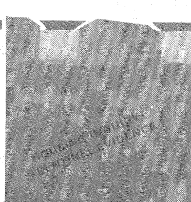
HOUSING INQUIRY SENTINEL EVIDENCE P.7