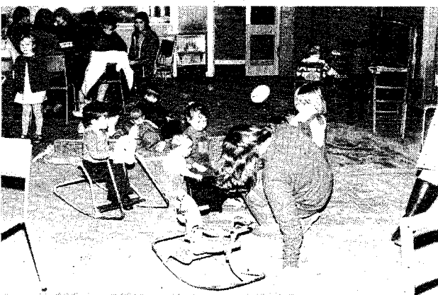
Children at play in the Calders Community Centre. One of the many activities in the area.

Other regular events include a playgroup every weekday from 9.30-11.30,