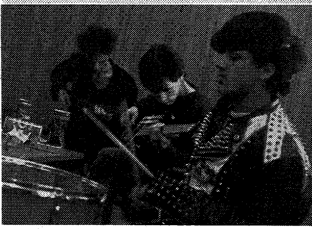
Playing all night - these musicians kept the tunes flowing until the next day to raise funds for the Gala.