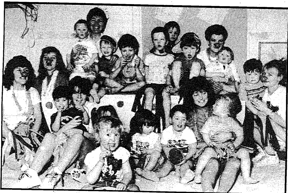
HI-JINX Hawaiian style - as the kids at Wester Hailes Child Care Project get into the groove of their Hawaiian beach party - in sunny Hailesland! Even the grown-ups got in on the act, donning red noses and a variety of suitably silly disguises for Comic Relief.

TWENTY pence on a packet of fags, 6 pence on a pint of beer and 55 pence on a bottle of whisky! Yes folks, it's that time of year again. When the man with the wee red brief case decides how much money he can squeeze out of the populace - without losing too many votes.